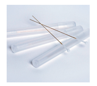
Disposable probes No need for time-consuming disinfection and sterilization procedures.