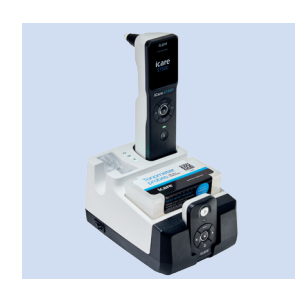
SmartCradle Docking station to charge the iCare ST500 and accommodate a probe applicator, a probe box, and the remote control.