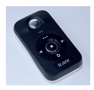
Remote control* The tonometer can be operated with a handy remote control.