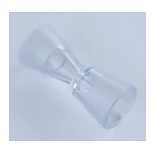
A probe applicator For easy probe insertion.