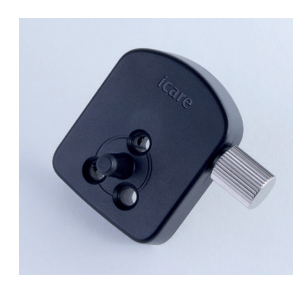
Universal adapter For most slit lamps with 8 mm focus rod mount hole. Stable patient positioning for easier measurement.